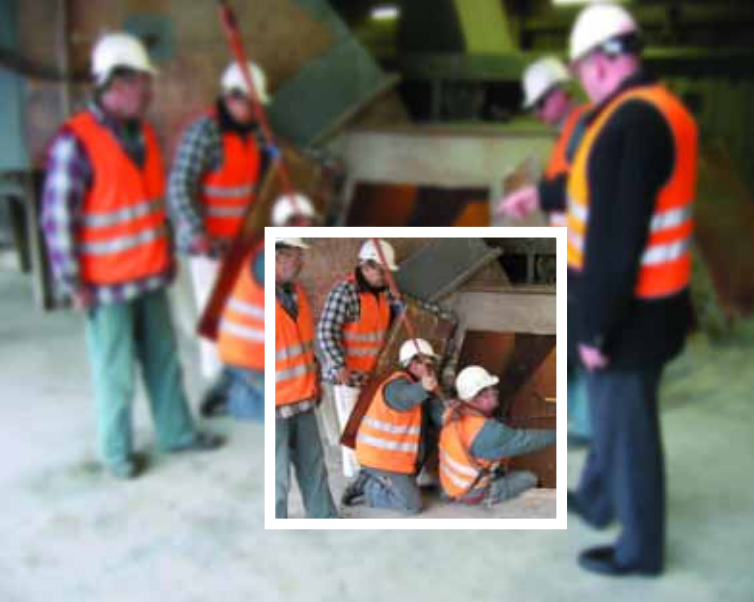
Safety training on the procedures for working in confined areas at Jura Cement, Wildegg facility.